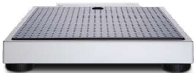
The flat design and slip-proof surface ensure easy access and a secure stance.

Special mention should be made of the double display that lets the patient and medical personnel read the results from two different directions at the same time. Thanks to a protected toggle switch and a manual power switch, which prevents unintended activation during transport, the function of the scale is always ensured even under difficult conditions.