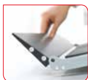
Integrated ramp folds up for troublefree transport.

After weighing, the seca 677 can be folded together in no time at all to save space. The sturdy locking device between rail and platform ensures the scale stands safely also when folded together. The rail also serves as handle when the scale is folded together, meaning that the seca 677 can be moved and stored away easily and quickly on the smooth-running transport castors.