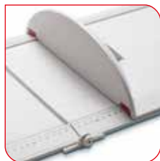
The measurement results are easy to read from the large scale.

The lightness of the measuring board is matched by the high quality of the folding mechanism, head piece and foot positioner. Special attention is paid to the choice of materials which can stand up to years of tough use without losing their shape. Additional protection is provided by the seca 412 carrier bag made of water-repellent lightweight nylon.