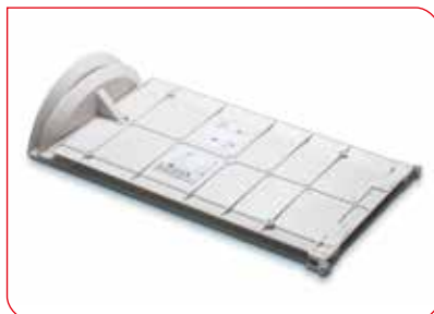
The high-quality folding mechanism guarantees a long service life.