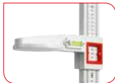
Level for precise and reliable measurements.