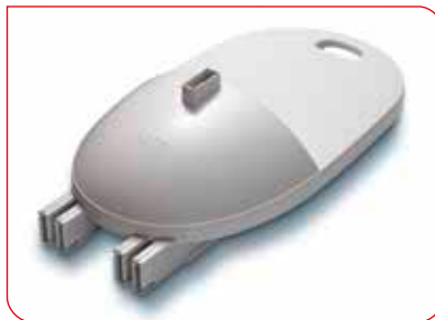
Integrated handle and secure catches on all individual parts for transport ease.