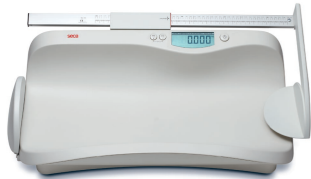
Image contains optional measuring rod seca 233.