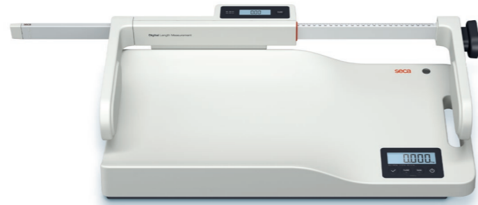
Image contains optional measuring rod seca 232n.