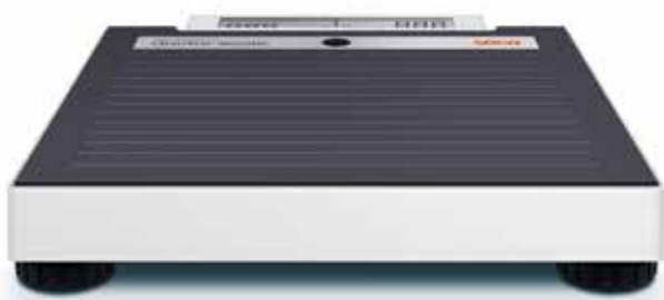
The flat construction and non-slip tread make it stable and comfortable to step onto.

A good name is earned through quality and modern functionality. That is why the seca 878 dr has been labeled the "doctor scale". It indicates the value of the product while reflecting the professionalism of the user. The label gives users certainty about the precision of the measured values and can be exchanged for personalized messages. Further information can be found at www.seca.com/doctorscale .