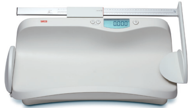
Image contains optional measuring rod seca 233.