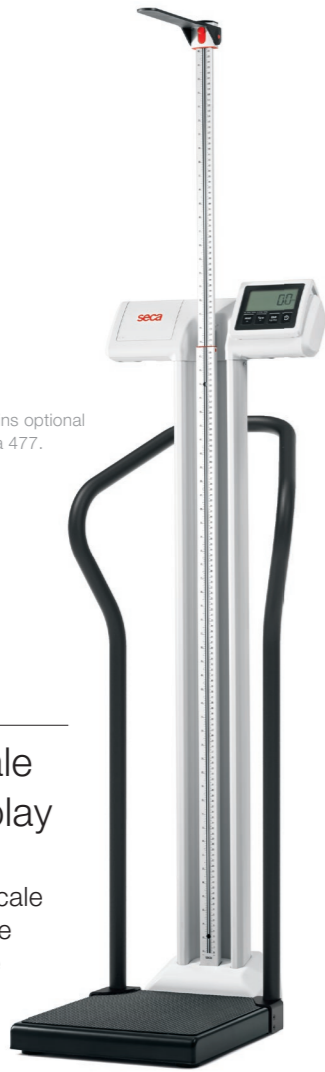
Image contains optional handrail seca 477.