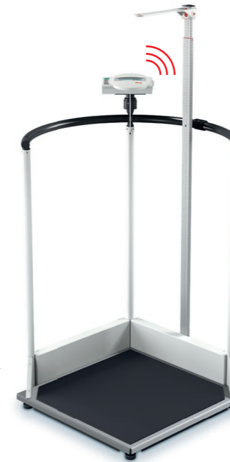
Image contains optional measuring rod seca 223.