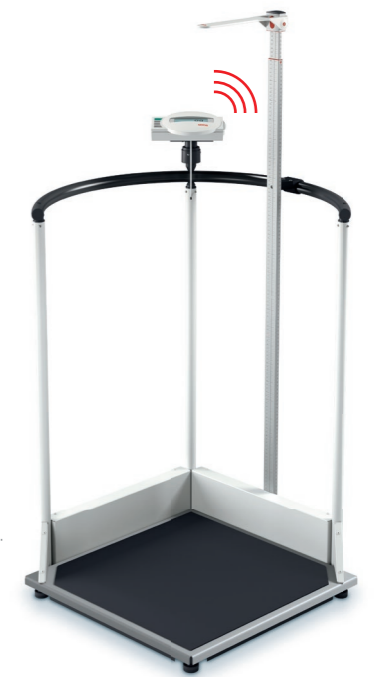
Image contains optional measuring rod seca 223.