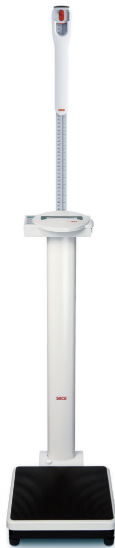
Image contains optional measuring rod seca 220.